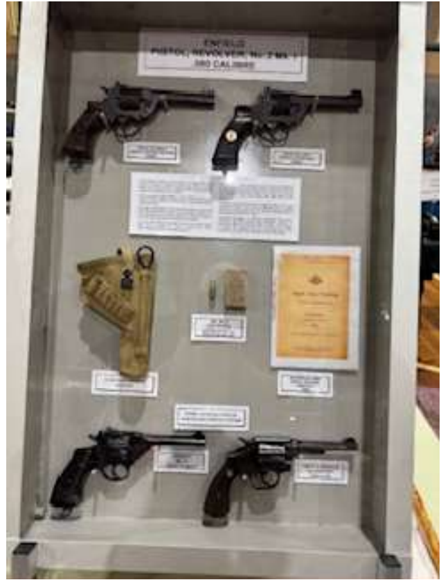
The Enfield revolver No 2 Mk1