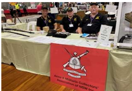
AMCA of NSW display stand at The Hunter Valley Arms Fair, 10 Bent st Maitland Sep 2025.