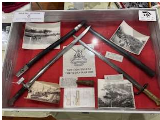
ACMA Sudan War Display