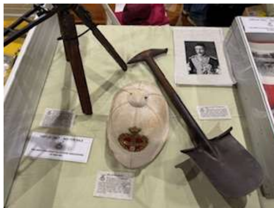
ACMA Sudan War Display