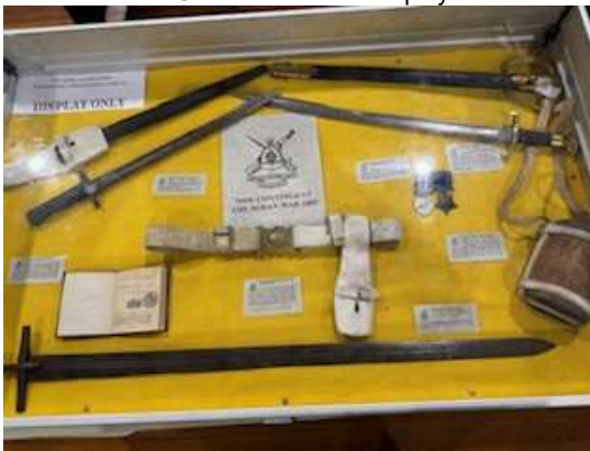
ACMA Sudan War Display