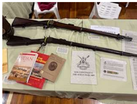
ACMA Sudan War Display