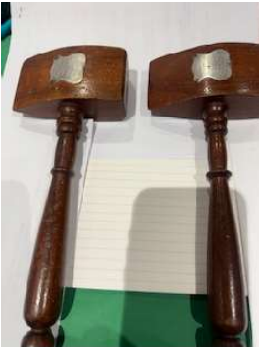
Two Masonic Gavels Dated 7/11/34