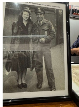
Cira WW2 America GI, of 90 th BOMBARDMENT GROUP (Heavy) US Army; Air Force.

BSB 062-107 a/c 2803 2772 (don't forget to add your name as reference)