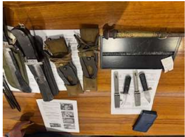
Folding Machete. WW2 Wire cutters, Parachute knife and short fighting knife.