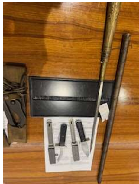
Japanese Sword stick / Cane