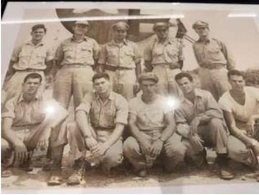
Circa WW2 Pers of 90 th BOMBARDMENT GROUP (Heavy) US Army; Air Force. Based in Australia at "Iron Range" from Nov 1942 – Jan 1945.