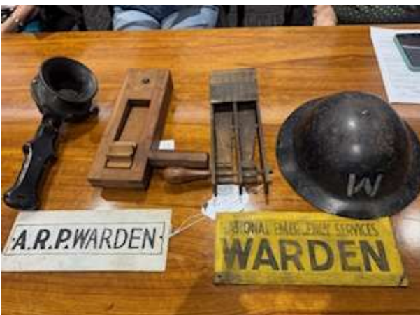
Sirens, Clackers, Warden's Helmet and signage for Circ WW2 Aust Air Raid Protection Warden.