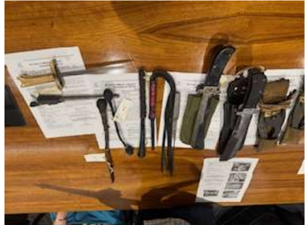
Prichard Bayonet, Coshes, Shivs, Folding Machete,