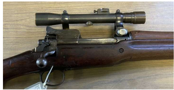
WW1 (&2) P14 Sniper