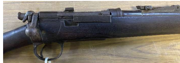
Lee-Enfield converted to magazine feed, captured by Turks at Gallipoli and converted in the 1930s to 8mm mauser