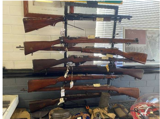
Note Trench shotgun on top (Very rare)