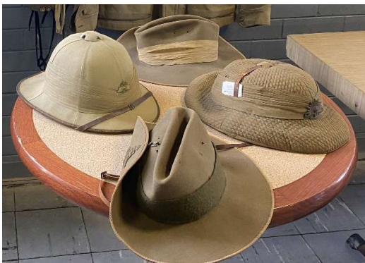
Headdress leading up to WW1

Note RH side Australian Modified Pith style (Very Rare)